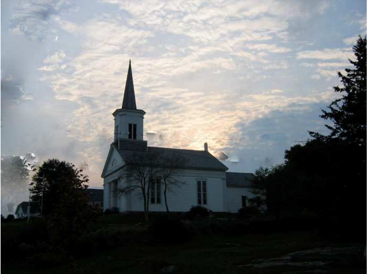
Canon A80 Steeple Church Portland Maine First the truth, then the SPIRIT of freedom & liberty will soar again. "Resistance to tyranny is obedience to God"