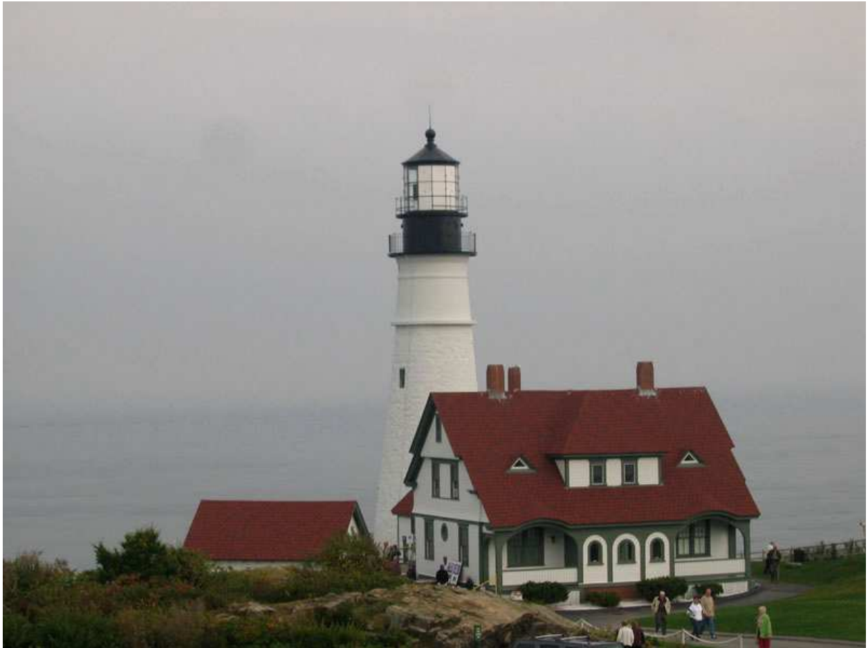
Canon A80 10-9-2006 Portland Maine Lighthouse 1791 First Federal Government Lighthouse